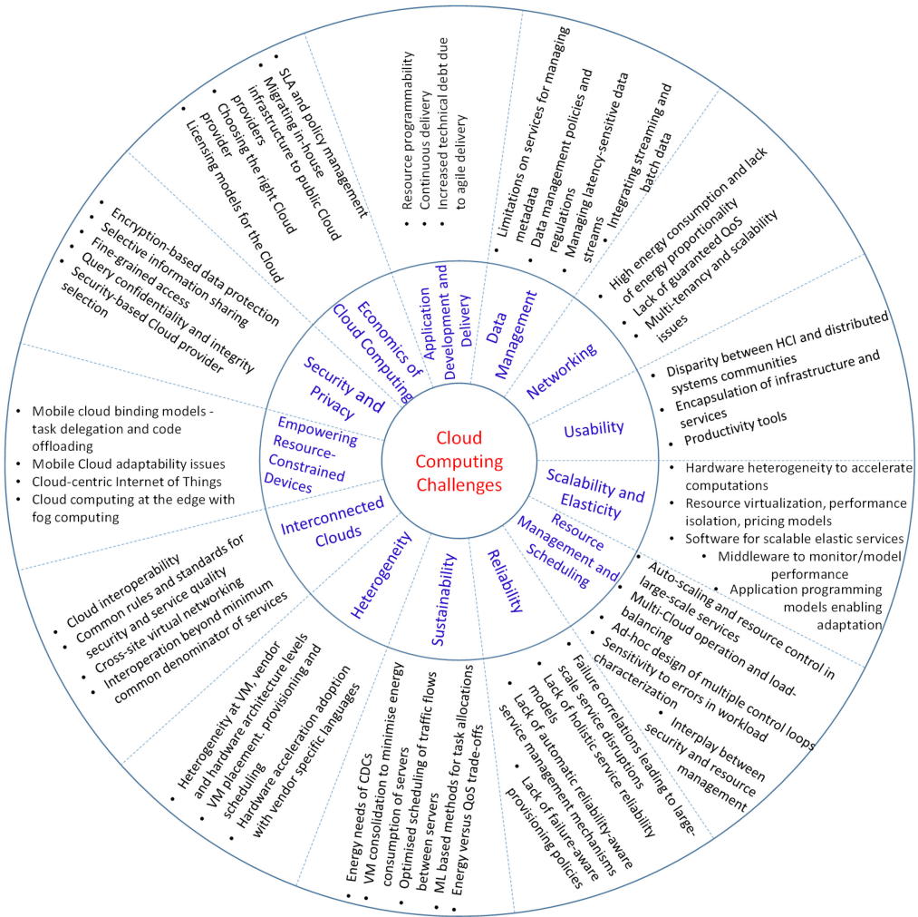
Fig. 2. Cloud computing challenges, state of the art, and open issues.