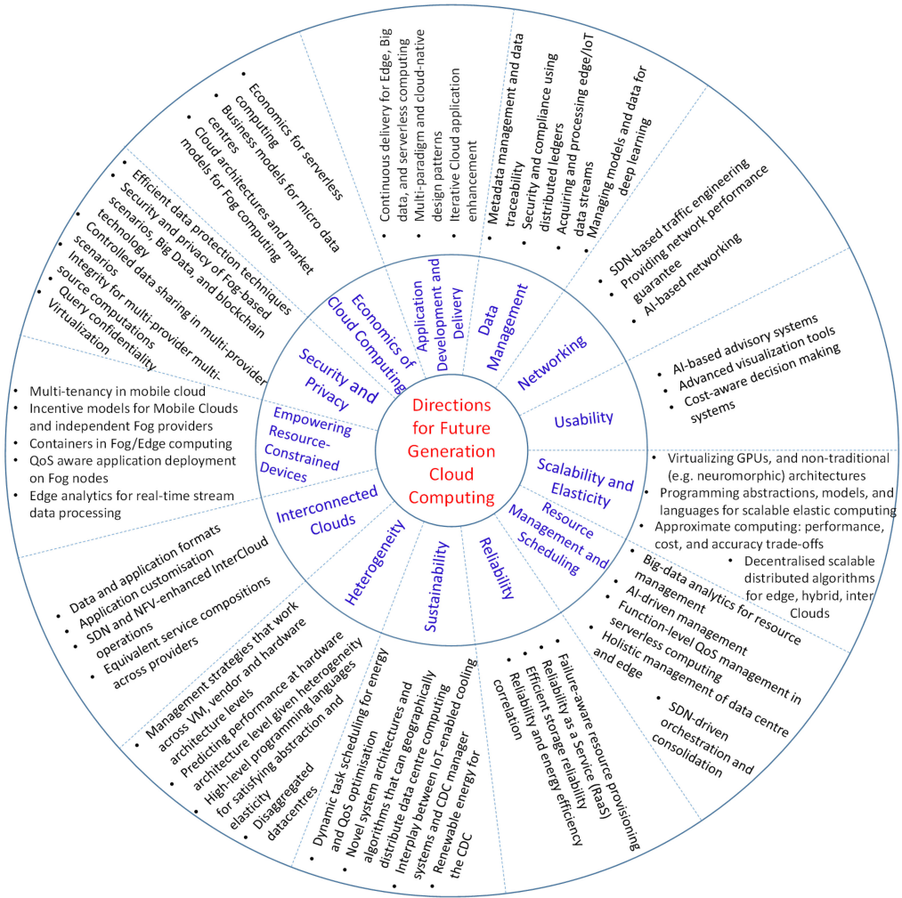
Fig. 3. Future research directions in the Cloud computing horizon.

heterogeneity, scale and load balancing applications developed through PaaS. Serverless computing is an emerging trend in PaaS, which is a promising area to be explored with significant practical and economic impact. Interesting future directions are proposed such as function-level QoS management and economics for serverless computing. In addition, future research directions for data management and analytics are also discussed in detail along with security, leading to interesting applications with platform support such as edge analytics for real-time stream data processing, from the IoT and smart cities domains.